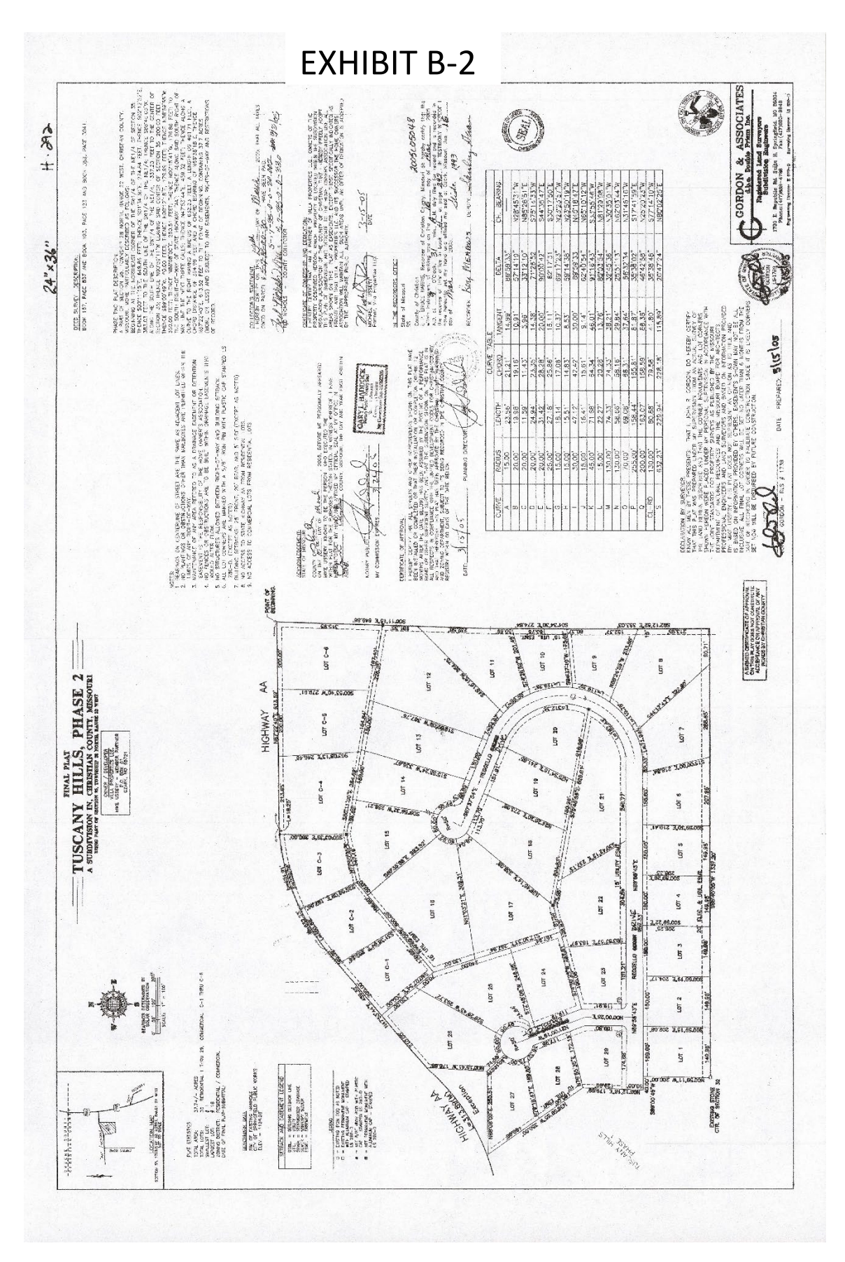
Page 28 of 49